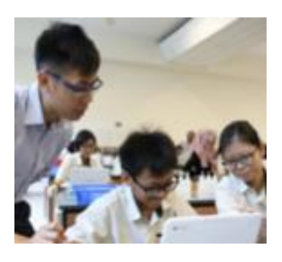
Enhance Teaching and Learning