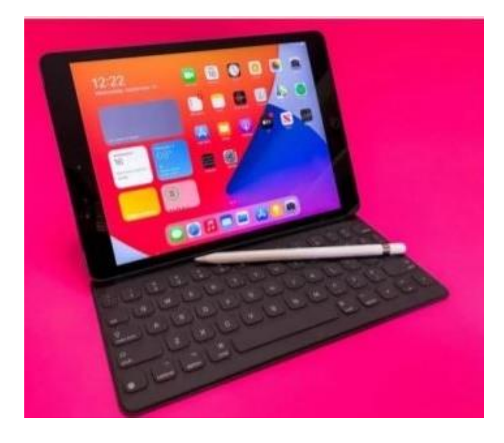
iPad 9<sup>th</sup> GEN 10.2" 64GB with Apple pencil, durable case plus keyboard