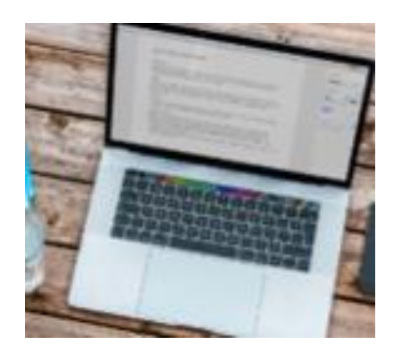
Support the Development of Digital Literacy

The use of the PLD for teaching and learning aims to: