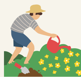
WORKING ON A PROJECT

To channel anxious thoughts or feelings in more productive ways, we might identify specific outlets to express creativity, such as working on a project, drawing, and athletics.